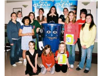
2008 winners with Moby

RRFB Nova Scotia will be holding their 10th annual "Nova Scotia Recycles" Contest which is open to students in grades primary to twelve. There are over $55,000 in cash and prizes, including $500 for the schools of the winning students. Scholarships are also available in the grade twelve category. There is $20,000 available in regional scholarships including a $5000 scholarship for the best Provincial Grade 12 essay. Contest packages will be mailed to schools in October. For more information on the contest please visit www.rrfb.com .